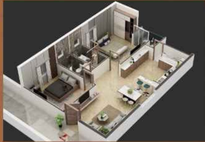
Flat Nos. 10, 11, 22 1215 SFT | 2 BHK North Facing