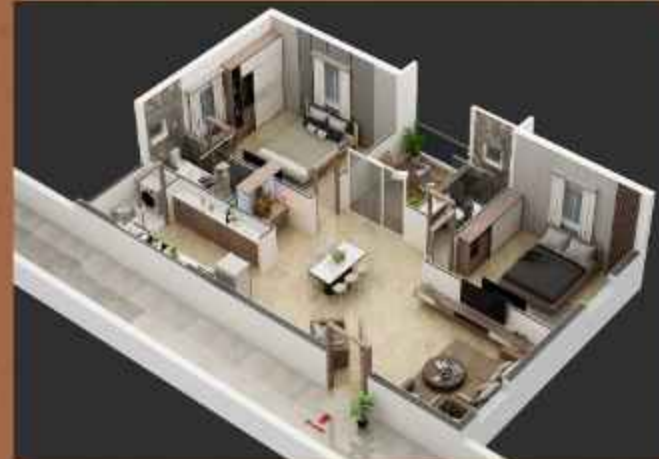
Flat No. 06 1310 SFT | 2 BHK East Facing